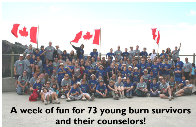
A week of fun for 73 young burn survivors and their counselors!