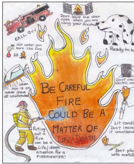
Grand Prize (tie) Tarneet, Grade 7 Dasmesh Punjabi School