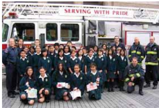
St. Patrick's Elementary School Vancouver

Posters are judged by Burn Fund sponsors and Burn Unit healthcare professionals. They look for age appropriate skills, simplicity of message, creativity, and the ability to convey safety messages to others.