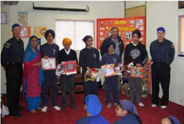
Khalsa School, Vancouver