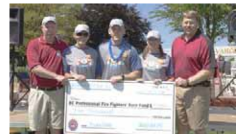
Abbotsford Fire Fighters Local 2864 — $5,000