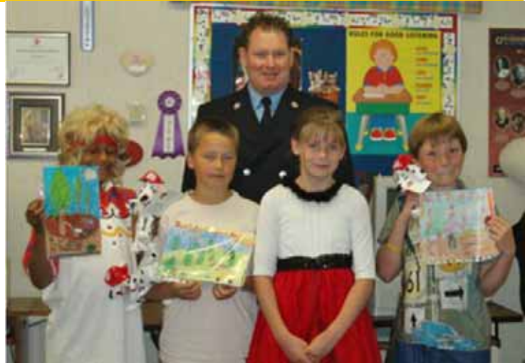
Heritage Christian School, Kelowna