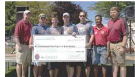
Surrey Fire Fighters Local 1271—$10,000