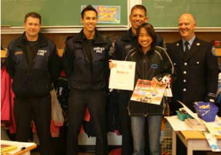
Fraser Wood Elementary School, Surrey