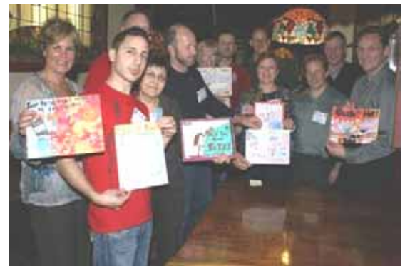
BAW Poster Contest Judges