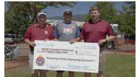
Fort St. John Fire Fighters Local 2143—$12,000