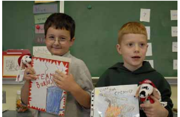
Powell River Christian School, Powell River